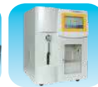
Liquid Partical Counter