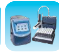
Total Organic Carbon 3800